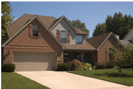
Figure 1 Home Entering Foreclosure Process

To understand how the foreclosure process works, click on the picture.