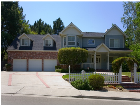
Figure 2 Sample Home in $375,000 Price Range

Below is a picture of the type of house that the new communities are building for families who can afford a home in the $375,000 range.